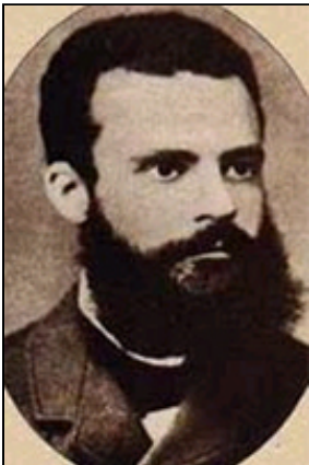
In 1867 Vilfredo Pareto earned a degree in mathematical sciences, and in 1870 a doctorate in engineering. In 1906 he made the famous observation that 20% of the population owned 80% of the property in Italy, later generalized by Joseph M. Juran and others into the so-called Pareto Principle (also termed the 80-20 rule. Source: Wikipedia)

whose life spanned the end of the 19 th and beginning of the 20 th centuries. Pareto pioneered the use of statistics to explain the economic and sociological actions and reactions of financial