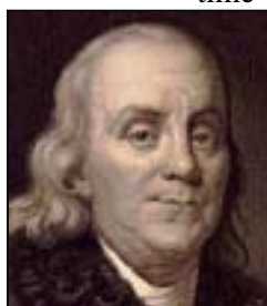
Ben Franklin would list the “pros” and “cons” to compare choices.

Life Insurance Cash Values. Pros: High degree of safety, stability and liquidity over the long term. Whole life insurance contracts declare a minimum guaranteed